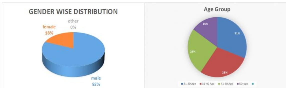
Figure 1. Participants Gender and age group.

Notable disparities emerged in knowledge and personal engagement with organ donation. Half of the medical students reported having no knowledge of organ donation, but this figure was dramatically higher among patients, at 87%. Similarly, 63% of students and 86% of patients had no knowledge of brain death or posthumous organ donation. Very few participants in either group had a relative who had received an organ (6% each). When asked about the source of organs, 44% of students cited organizations, whereas 87% of patients did so. A quarter of students had considered being a donor, compared to only 15% of patients. Willingness to donate was highly dependent on the recipient: 43% of students and 32% of patients were willing to donate to a relative, but these figures dropped to 36% and 24%, respectively, when the recipient was a stranger. Monetary factors were not a primary influence for either group, with 88% of students and 92% of patients stating it would not affect their decision.